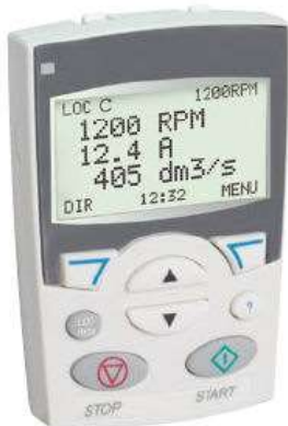
Operator's control panel

Input voltage: 3x380/480V AC , +10%/-15% Frequency: 45 – 65 Hz Power factor: > 0.95 at 3x400 V AC , full load Connection: Terminal block Other: See table 1 & 2